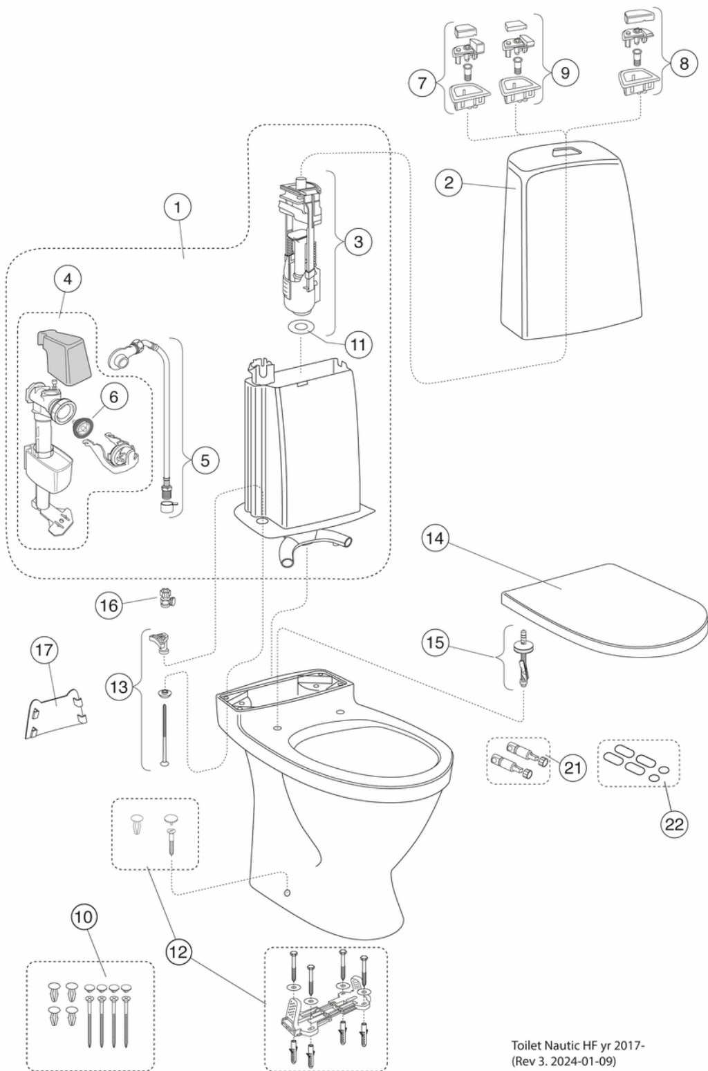
Toilet Nautic HF yr 2017- (Rev 3. 2024-01-09)